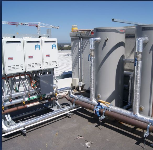
Centralised Bulk Hot Water