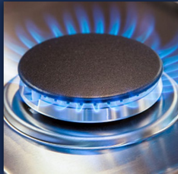
Embedded Gas Networks