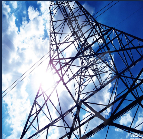
Embedded Power Networks