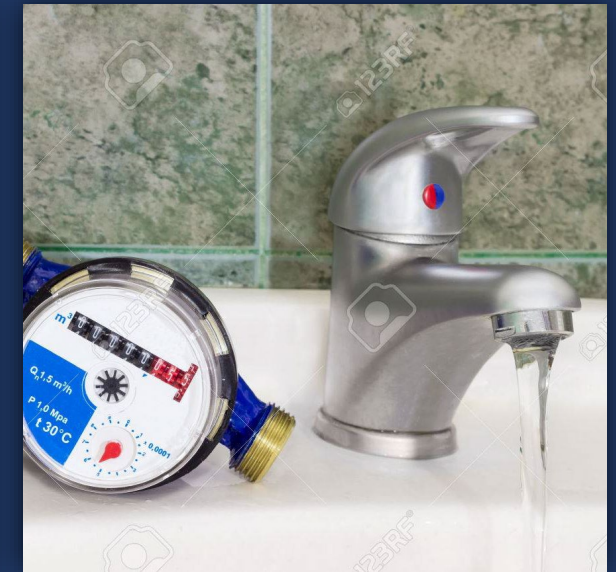
Cold Water Metering